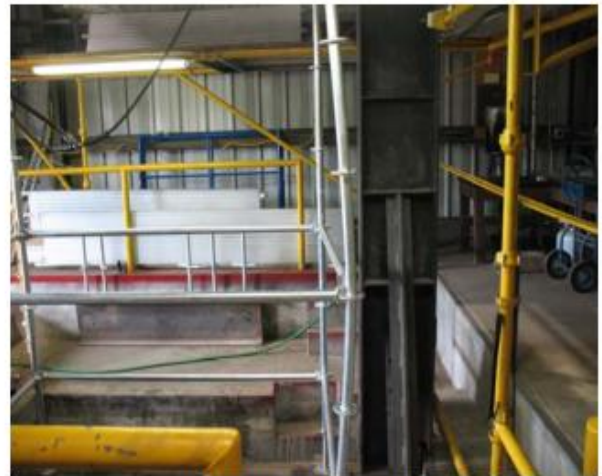
10' Ringlock at 39,440 lbs.

Our letters and reports are for the exclusive use of the client to whom they are addressed and shall not be reproduced except in full without the approval of the testing laboratory. The use of our name must receive our written approval. Our letters and reports apply only to the sample tested and/or inspected, and are not indicative of the quantities of apparently identical or similar products. Material submitted to our metals department will be discarded after a period of 30 days unless otherwise directed.