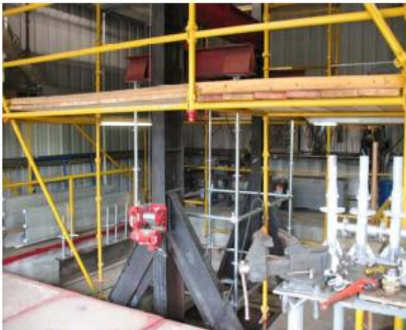
10' Ringlock System at Pre-Load