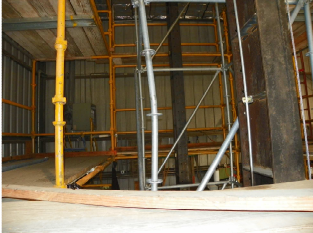
Deflection Point at 67,380 lbs.

This document contains technical data whose export and re-export/retransfer is subject to control by the U.S. Department of Commerce under the Export Administration Act and the Export Administration Regulations. The Department of Commerce's prior written approval may be required for the export or re-export/retransfer of such technical data to any foreign person, foreign entity or foreign organization whether in the United States or abroad.