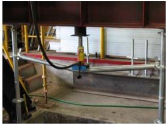
Point Load at 2,165 lbs.