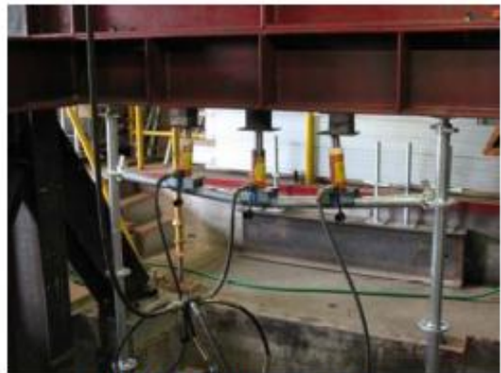
Uniform Load at 2,935 lbs.

Our letters and reports are for the exclusive use of the client to whom they are addressed and shall not be reproduced except in full without the approval of the testing laboratory. The use of our name must receive our written approval. Our letters and reports apply only to the sample tested and/or inspected, and are not indicative of the quantities of apparently identical or similar products. Material submitted to our metals department will be discarded after a period of 30 days unless otherwise directed.